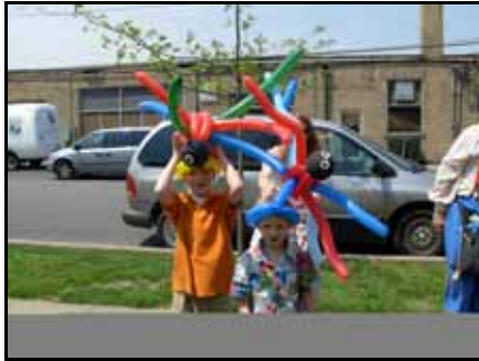
FAMILY PICNIC FUN!!!